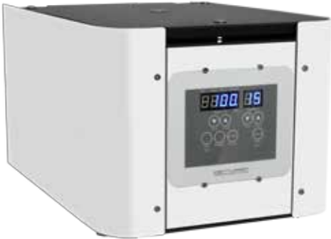
Display indicative only