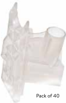
Pack of 40

Double sample holder with card (up to 1ml)