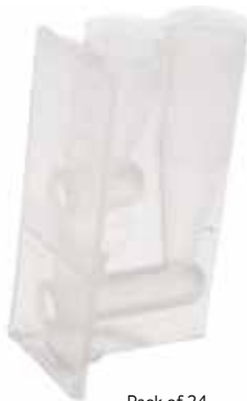
Pack of 24

Single sample holder with card (up to 1ml)