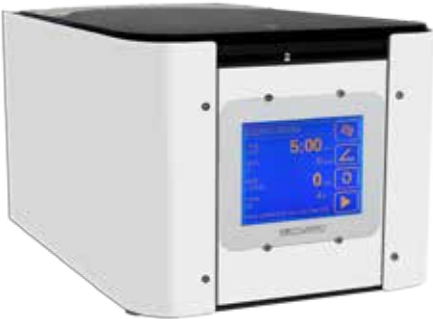
Display indicative only