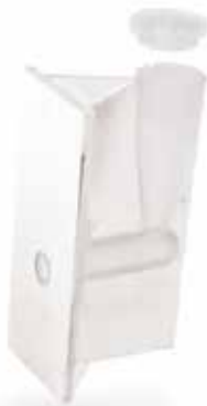
Pack of 24