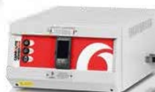
3508P1 programmer option

The versatile stand shown above allows the furnace to be positioned either vertically or horizontally.