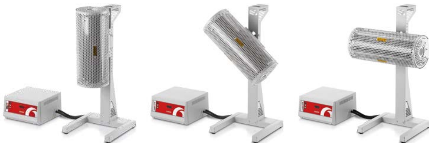
EVA 12/300 Angle adjustment option allows horizontal and multi-angle configurations