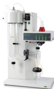
Mini Spray Dryer B-290 World leading laboratory Spray Dryer