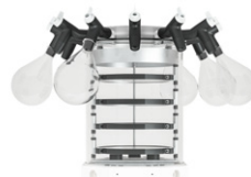
Acrylic chamber with manifold top and shelves for bulk, vial and flask drying