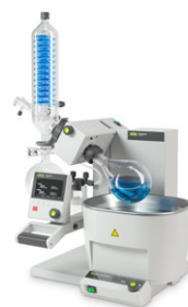
Rotavapor® R-300 Convenient and efficient rotary evaporation