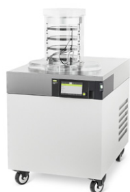
Lyovapor™ L-300 The first lab Freeze Dryer for continuous sublimation