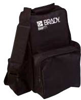
Soft carry case