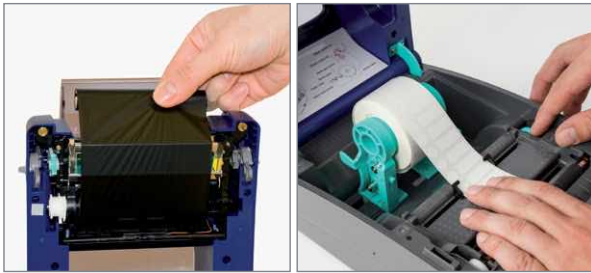
Step 1: Insert media