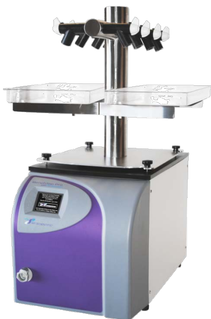
(BenchTop Pro 9L with optional tree-type manifold and condensate pan kit shown).