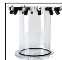
Vertical Drum Manifold