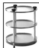
Bulk Shelf Rack

12-Port Stainless Steel Vertical Manifold