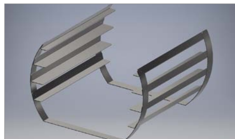
4 position shelf rack