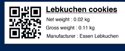
Example printouts with ET Individual Print