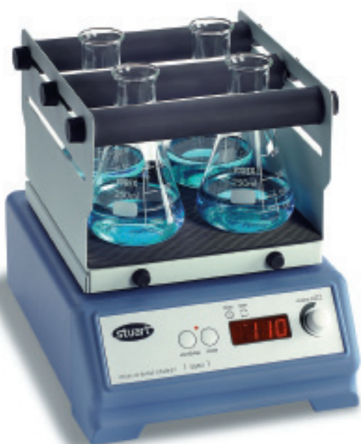
SSM1 with SSM1/1