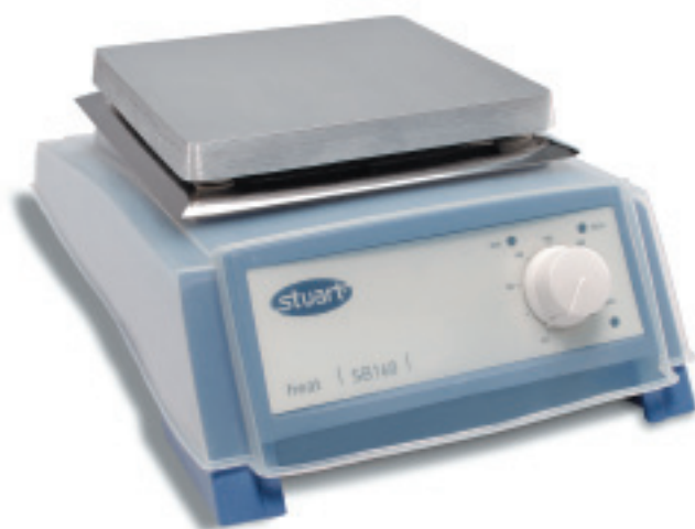
SB160 with SB16/1 cover