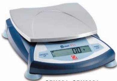
SPU601, SPU2001, SPU4001, SPU6001, SPU6000