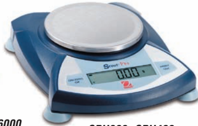
SPU202, SPU402, SPU602, SPU401