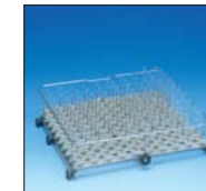
100 IXA RACK SHORT 2 MM INJECTORS