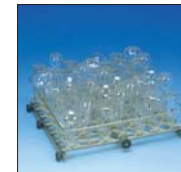
48 IXC RACK SHORT INJECTORS