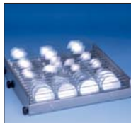
BP RACK FOR PETRI DISHES