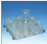
PST STANDARD BASKET

Available accessories include basic baskets for open mouth glassware such as beakers and dishes. Injector racks are available for narrow neck glassware including Erlenmeyer and flasks. Special racks available for pipettes and other miscellaneous items.