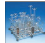
36 IXL RACK SHORT AND LONG INJECTORS