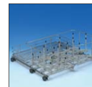
P5/27 IXLC MIXED RACK