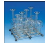
20 IXL RACK LONG INJECTORS