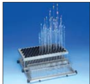
116 PPI RACK FOR PIPETTES