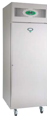
top mount models for maximum storage capacity

GUARANTEEING YOU THE GREENEST REFRIGERATION AVAILABLE