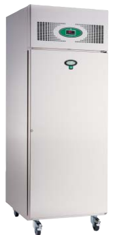
lower height top mount model EPRO G 400