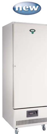
under mount model for high ambient applications