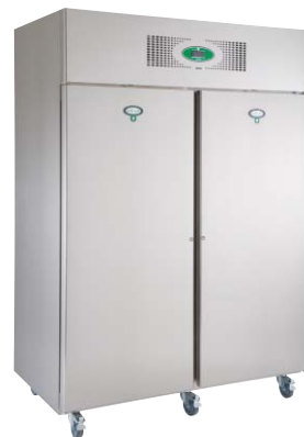
double door models for maximum storage space on a given footprint