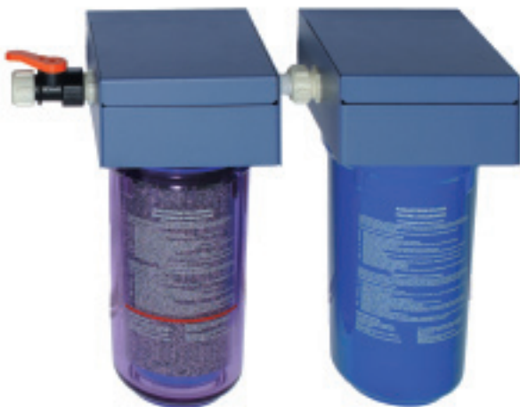
Deioniser and filter connected via ALC and fitted with wall mounting brackets