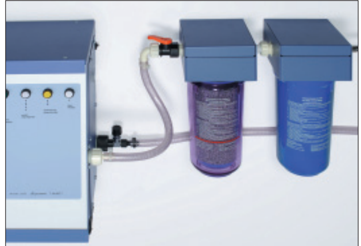
Aquatron® connected in series with deioniser and filter