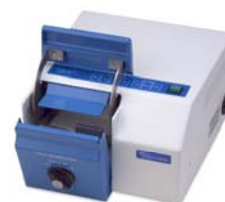
Stomacher® 80 micro Biomaster with adjustable door to allow in process paddle pressure variation.