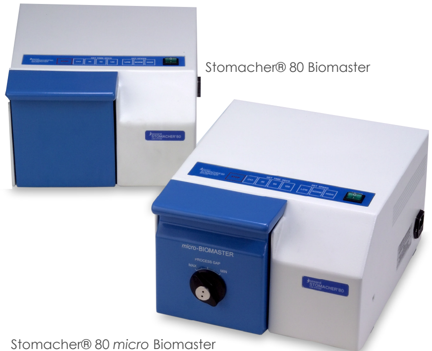
Stomacher® 80 Biomaster