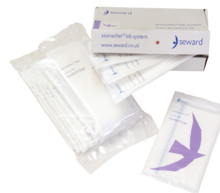
Cardboard and plastic carry pack