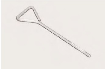
Inoculating hook made of glass (Drigalski-hook)