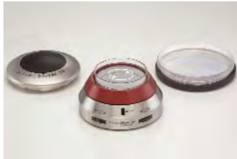
schuett petriturn-E with foot-switch and turntable-attachment for Petri dishes up to Ø 150 mm (optional)