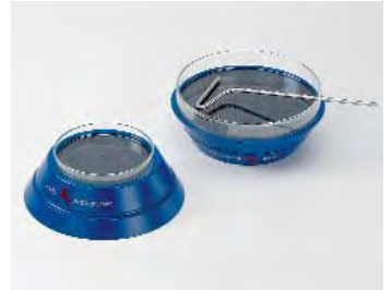
schuett petriturn-M with inoculating hook (optional)

Useable on both sides, that means two work spaces in one device by easiest turn-over. For Petri dishes with Ø 100 and Ø 150 mm diameter.