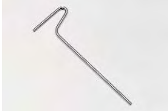
Inoculating hook made of stainless steel (Drigalski-hook)