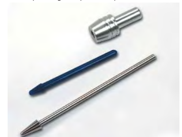
EPPI-pestle made of polypropylen and stainless steel with quick-grip clamp