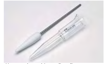
Homogeniser with overflow flare with lip and teflon pestle, tapered

Please moisten pestle and homogenising vessel before homogenising. Carefully insert the pestle into the homogenising vessel at a low rotational speed.