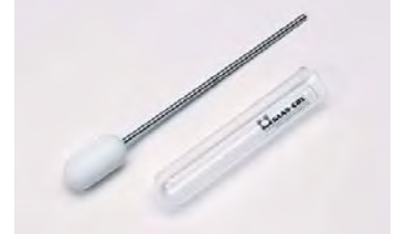
Homogeniser as centrifuge tube with teflon pestle, cylindrical