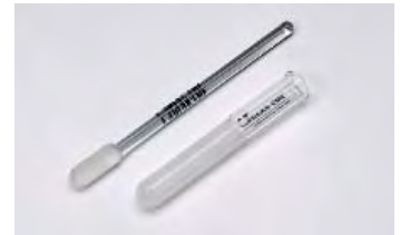
Homogeniser with overflow flare, without lip and glass pestle, cylindrical