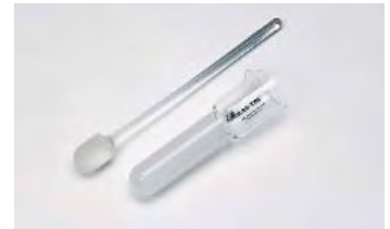
Homogeniser with overflow flare with lip and glass pestle, cylindrical