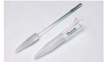
Homogeniser with overflow flare with lip and glass pestle, tapered