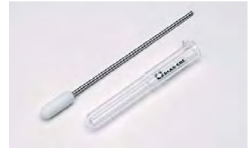
Homogeniser with overflow flare with lip and teflon pestle, cylindrical