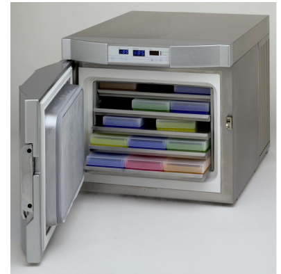
ProfiMaster PMU04.. with stainless steel horizontal rack with drawers and EPPi® Kryo boxes.