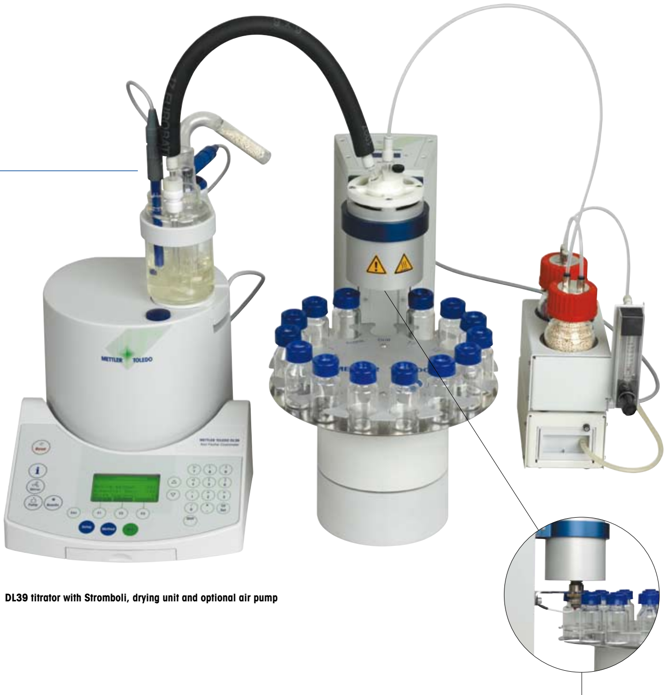
DL39 titrator with Stromboli, drying unit and optional air pump