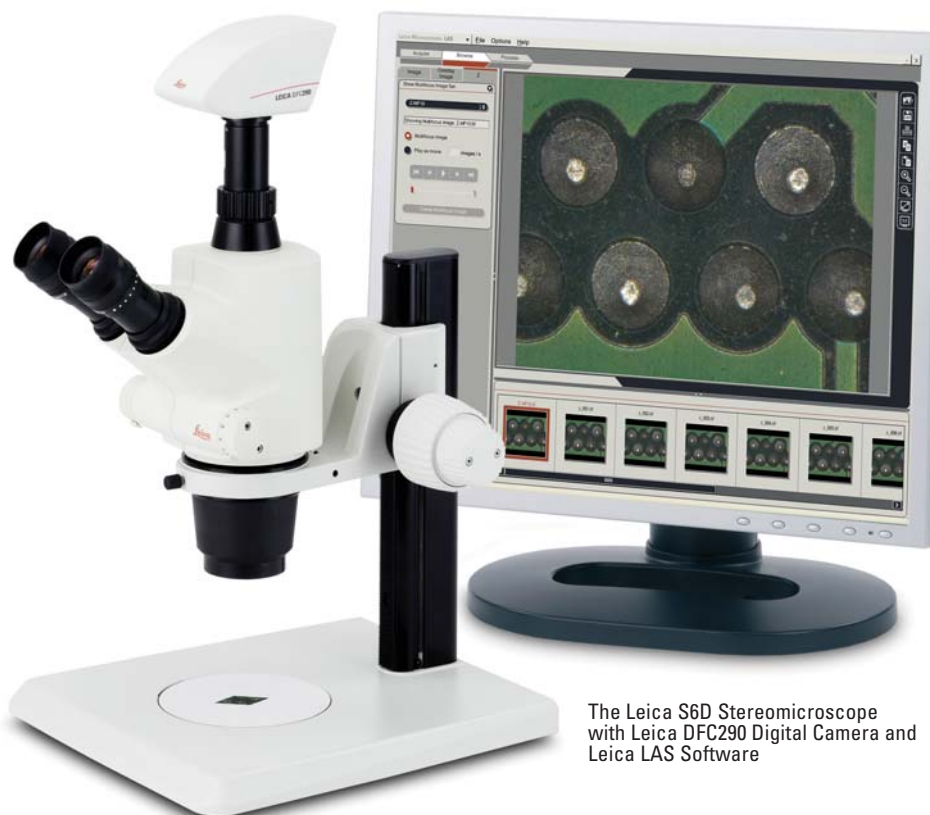
The Leica S6D Stereomicroscope with Leica DFC290 Digital Camera and Leica LAS Software