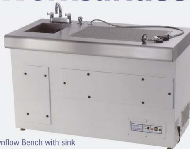
DFB15 Downflow Bench with sink

The units are available in four standard sizes, however as each laboratory may have slightly different requirements our experienced design team can plan and manufacture a style of bench with unique features to suit your exact needs.