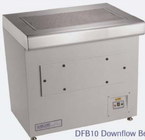
DFB10 Downflow Bench

All units are constructed from Zintec epoxy powder coated mild steel bases with 316 grade stainless steel worksurfaces. The ventilation grilles are fully removable to allow access to the spillage tray beneath, facilitating easy cleaning.