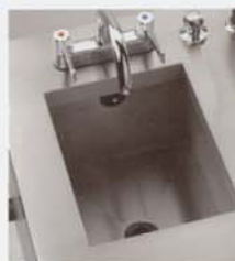
Wrist Action Taps fitted to sink units