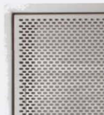
Removable perforated worksurface