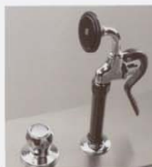
Optional Wash Down Facility

Formalin Dispensing System to ensure safe handling of formalin within the Laboratory environment.