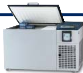
DF9010 (shown with optional recorder)