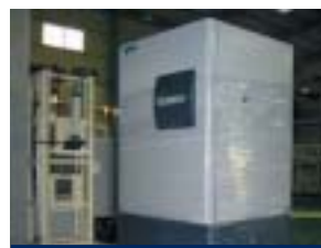
Packing the finished product