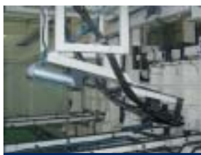
High pressure polyurethane foaming process