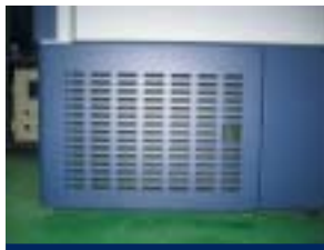
Filters are detachable and easily accessible through a condenser door. This makes cleaning the air filter a quick and easy job.

The system is designed with the customer always in mind