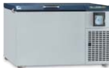
DF4514 (shown with optional recorder)