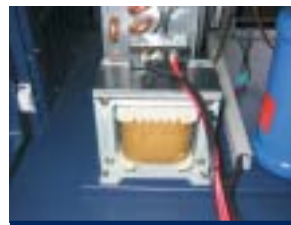
Automatic voltage compensation protects electrical components