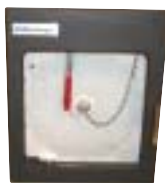
7 day Chart recorder