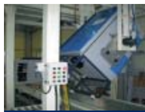
Compressor housing attachment