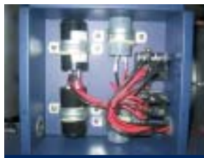
Start relays and capacitors minimize electrical load and reduce power consumption