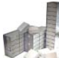
Aluminium storage racks