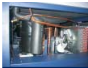
Extra large tropical condenser makes the system work without high pressures