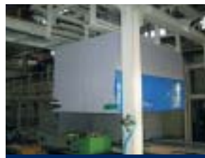
Installation of Internal chamber into exterior cabinet