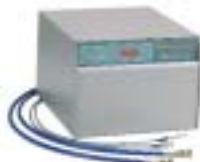
CO 2 back up system