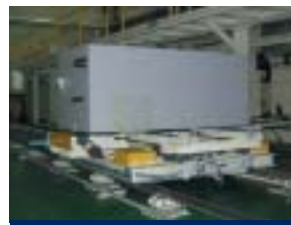
Preparation before foaming process