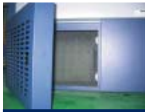
A safety condenser cover protects the customer when cleaning the filter