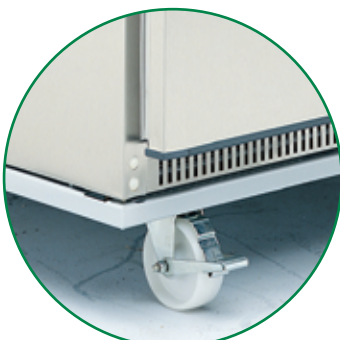
Castor Base Unit Available POA