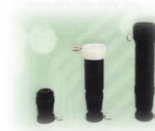
CCTV and Photo Adaptors

MZ-CCD1X 1X c-mount camera adaptor MZ-CCD0.5X 0.5X c-mount camera adaptor