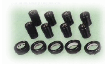
Auxiliary Objectives and Eyepieces