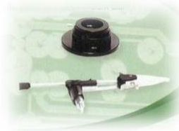
Darkfield Attachment and Gem Holder