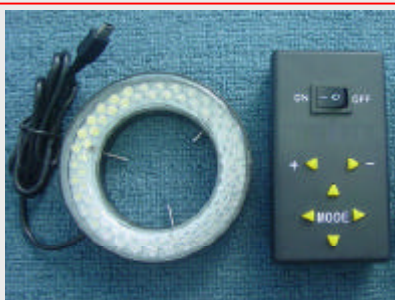
ULTRABRIGHT 144 LED Ringlight GXMLEDYK-B144T

Providing excellent white colour temperature, cool light with very long lasting LED lamp life and minimal intensity decay over time