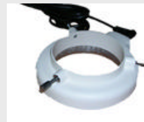
48 LED Ring Light GXMLED48T1

A low cost adjustable intensity LED ring illuminator with illumination control on the side of the ring light itself, supplied with a separate mains power adapter.