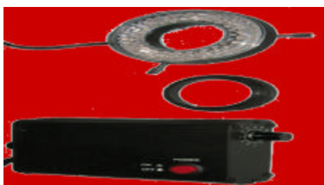
60 LED Ringlight GXMNORMA341103

A first rate and highly popular adjustable intensity LED ring illuminator with separate power controller.