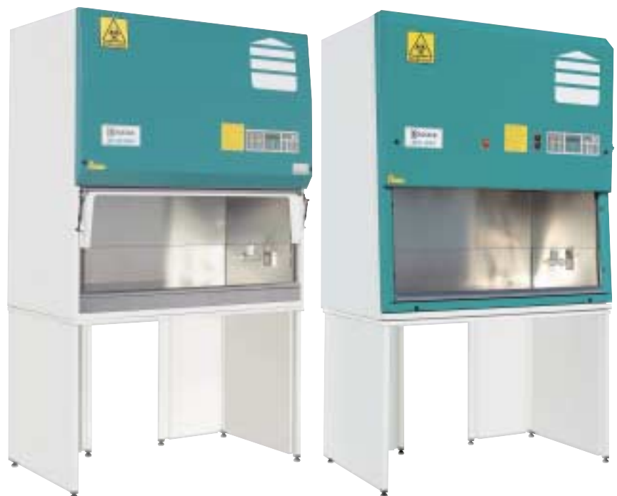
BH-EN fitted with hinged frontal safety glass-sash window.