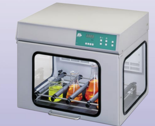
⑥ Incubator hood TH 30 - No. 6162 000