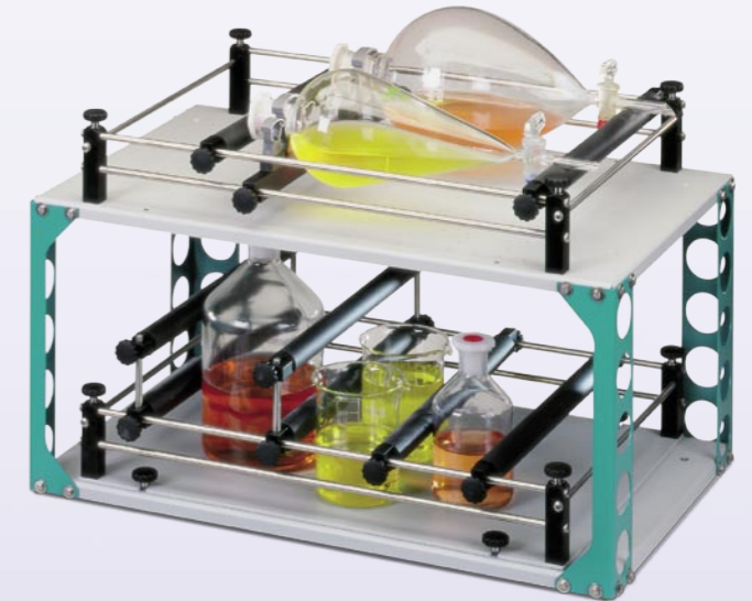
⑤ 2-storey top frame SM - No. 0052 065