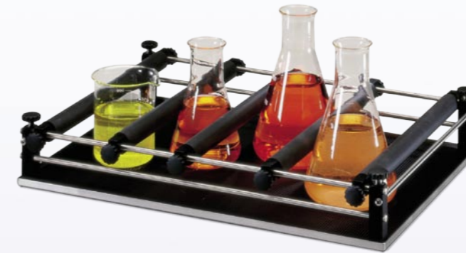
① Rack system Combifix SM A - No. 0050 154