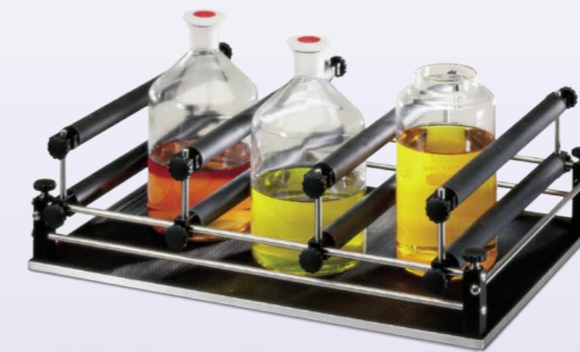
② Rack system Combifix SM B - No. 0050 155