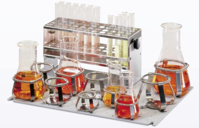
④ Universal tray SM - No. 0051 472