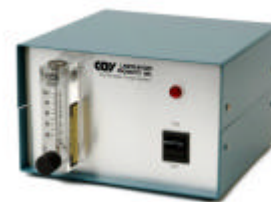
Dry Nitrogen Purge System

Humidification Apparatus: A Fan Assembly with an absorbent wick is mounted to the inside rear wall of the glove box, while the water reservoir and recirculating pump are outside. This system may also be controlled manually or automatically.