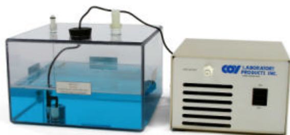
Humidification Apparatus, Ultra Sonic

NOTE: An optional Dry Gas Purge system (nitrogen/argon) is now available. If desired you may use a manually controlled dry nitrogen purge instead of desiccant capsules.