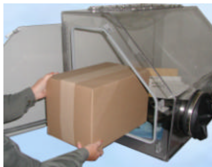
The 18" x 18" Side Door allows larger packages to fit inside the glove box.