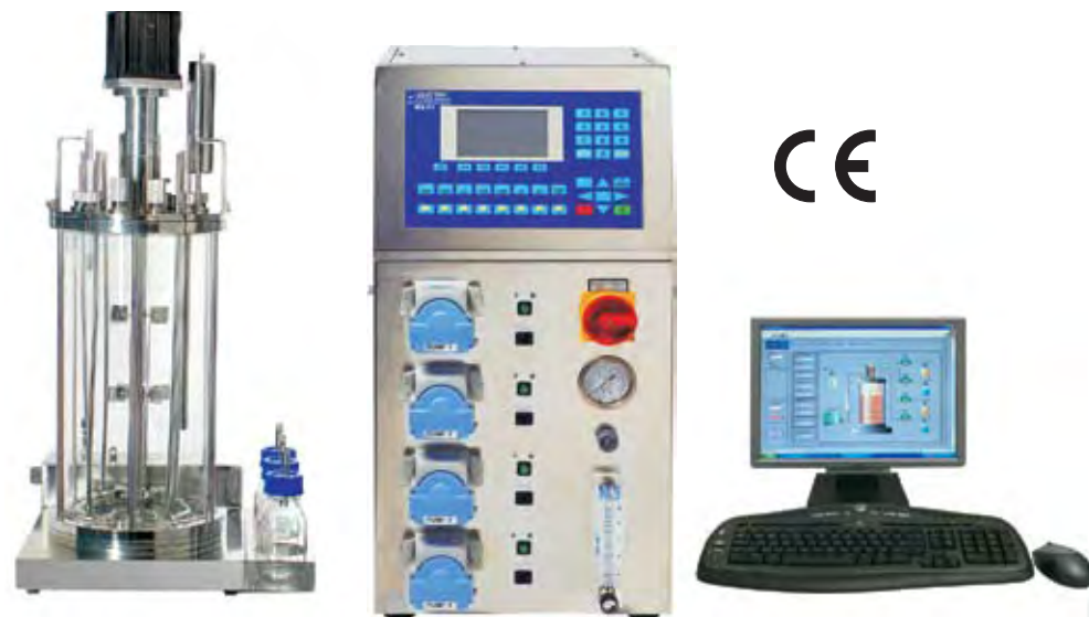
Single Vessel Fermentation System