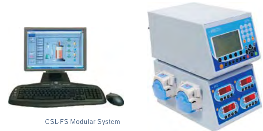
CSL-FS Modular System