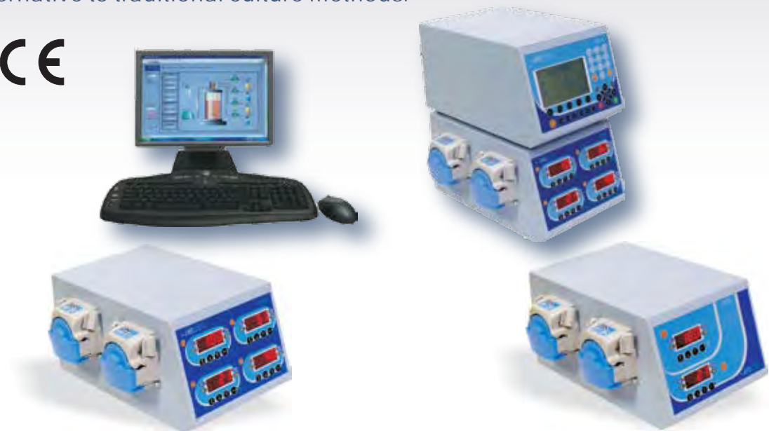
Cat. No. :CSL-FS series