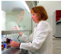
Basic Research / Research Institutes