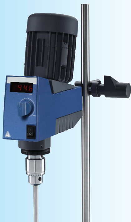
BOECO OVERHEAD STIRRER OSD-20