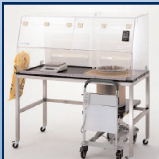
Flow Sciences FS-8500