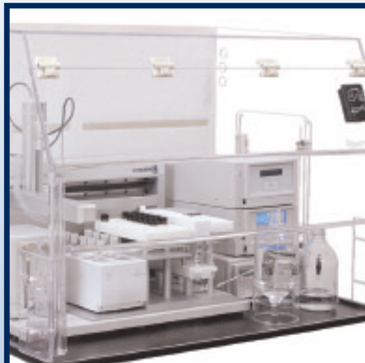
Flow Sciences FS-Robot1